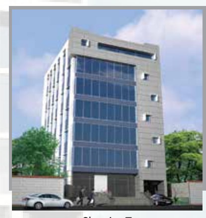
Shonim Tower Completed Project

SIMEC Properties is comprised of expert talented and experienced engineers, and architectures. Our success is based on our good track records of reliability and customer centricity. With our hard work and dedication, we become a significant brand of Real Estate Company over a very short time. Our focus on innovation and customer satisfaction has solidified our position in the market.